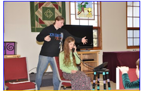
“Staged Reactions” group from Crossroads College.