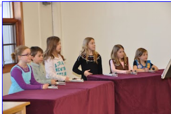
Beginning hand chimes group. . .