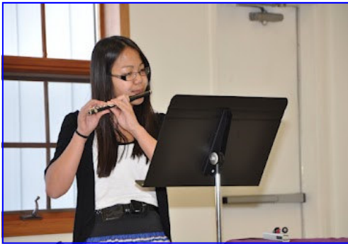
Willow on Piccolo. . .